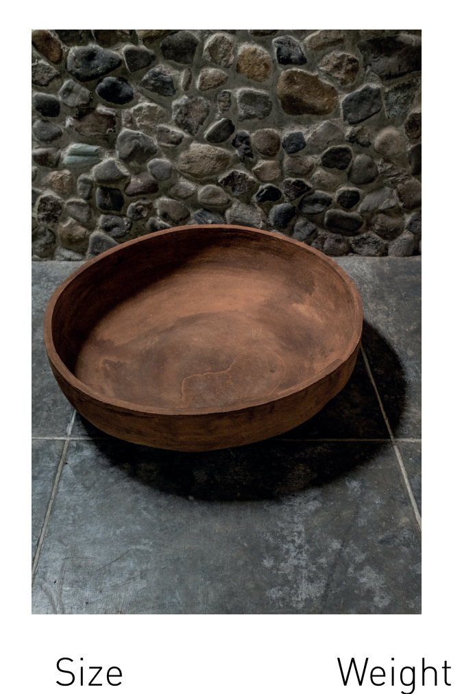
Size (height x diameter)